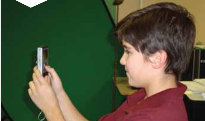
COCHRANE ELEMENTARY STUDENT USES DIGITAL VIDEO CAMERA.

development of the inline skate. They chose topics that hadn't already been covered on BrainPOP.